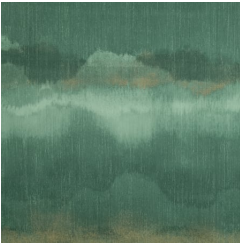
RZ21-08 - UNITY