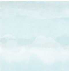
RZ21-04 - RADIATE