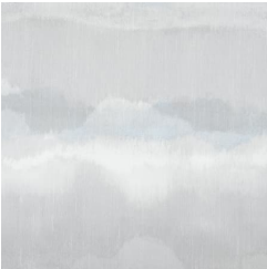
RZ21-03 - STRENGTH