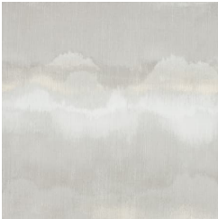
RZ21-05 - SOLACE