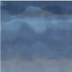
RZ21-07 - SERENITY