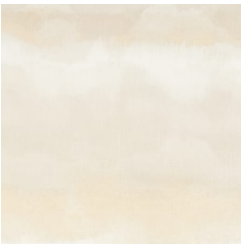
RZ21-02 - HARMONY