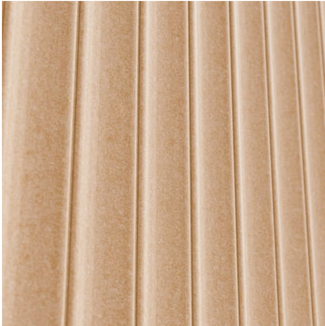
Emboss Panel Scallop Detail Ecru