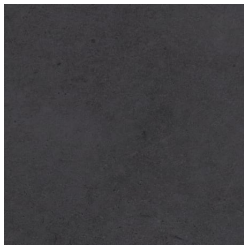
Concrete Dark Tint