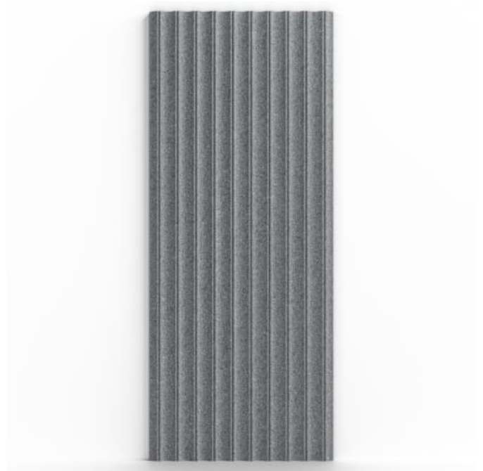
Emboss Panel Scallop Detail