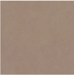
Terracotta Sun Bleached