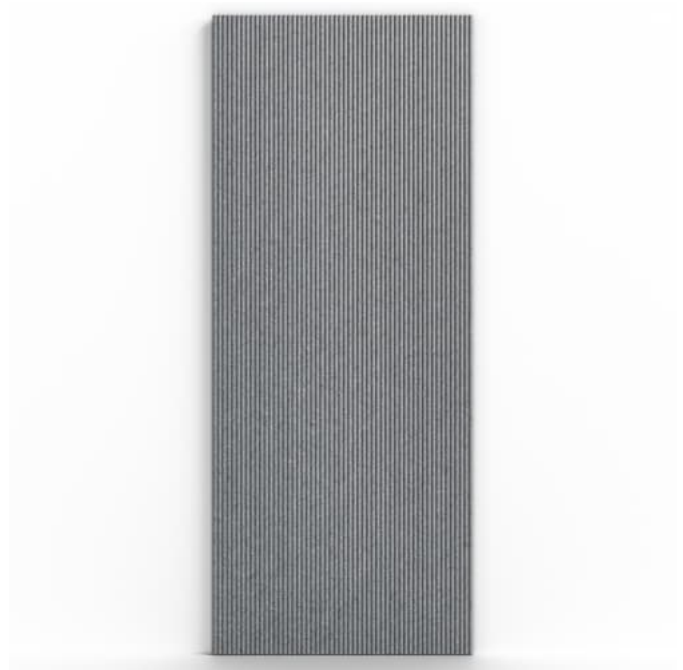
Emboss Panel Corduroy Fine Detail