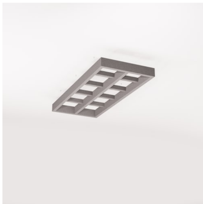
Beams Closed Rafter 2 x 5 Detail