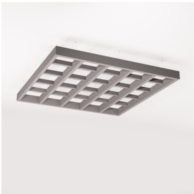
Beams Closed Rafter 5 x 5 Detail