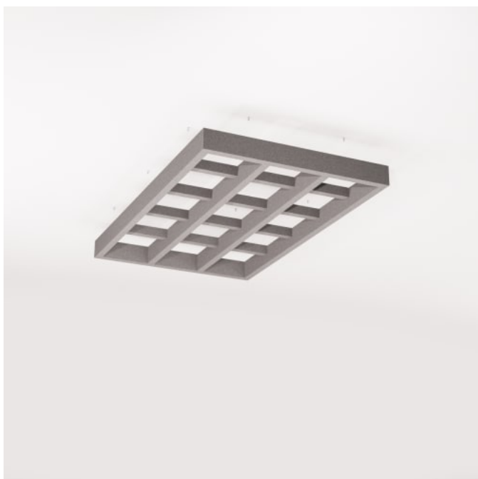
Beams Closed Rafter 3 x 5 Detail