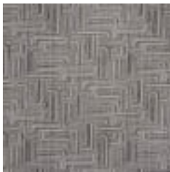
959 IRON ONE