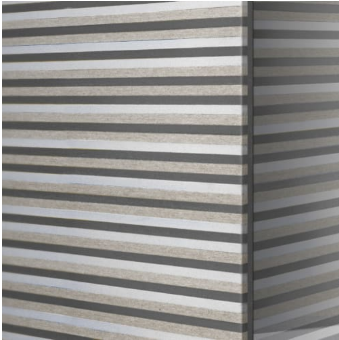
Layers Panel Frost, Greige and Fossil Detail