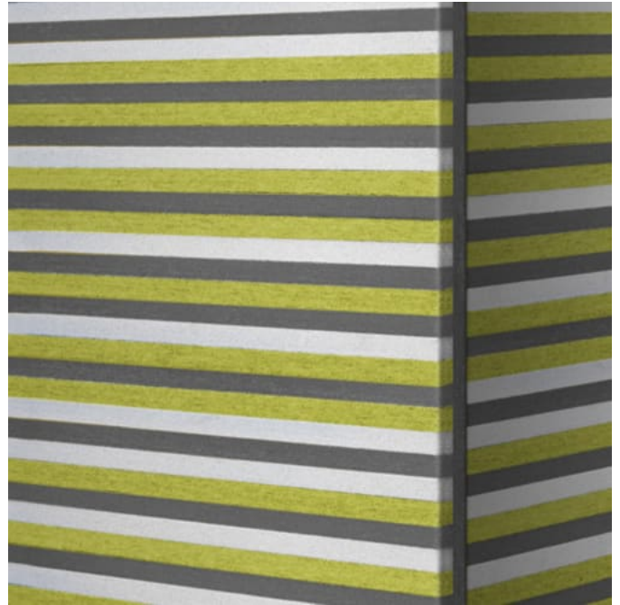
Layers Panel Frost, Greige and Grass Detail