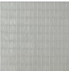
SG19-10 GRANITE GRAY