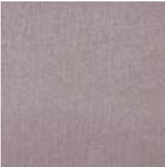
611 DUSKY PINK