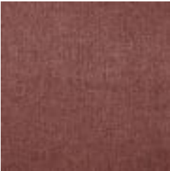
574 DARK CORAL