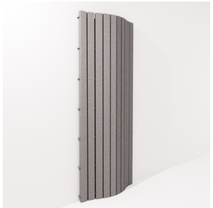
Curved Sticks Wide Detail