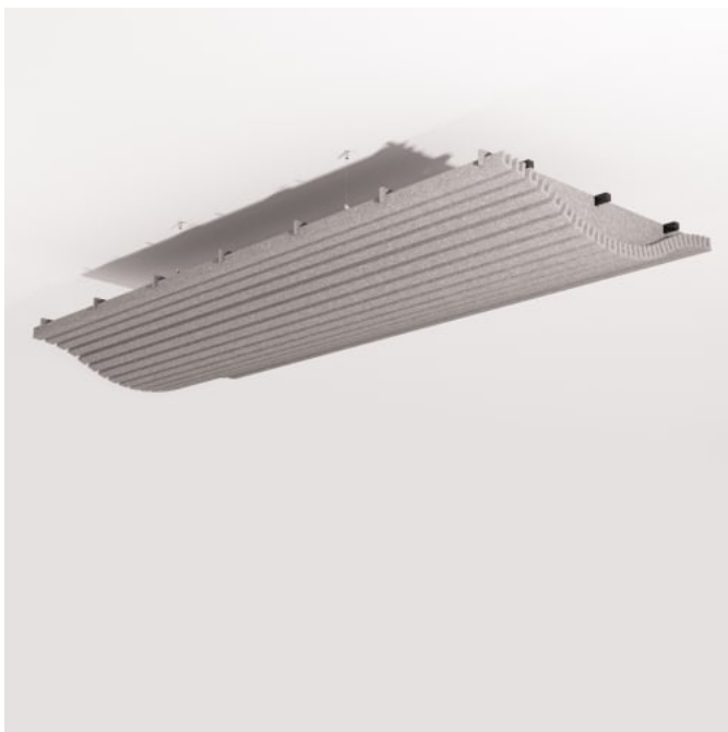
Curved Sticks Narrow Hanging Detail