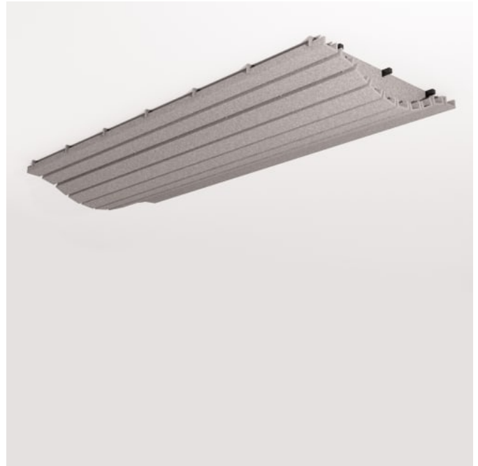
Curved Sticks Wide Ceiling Detail