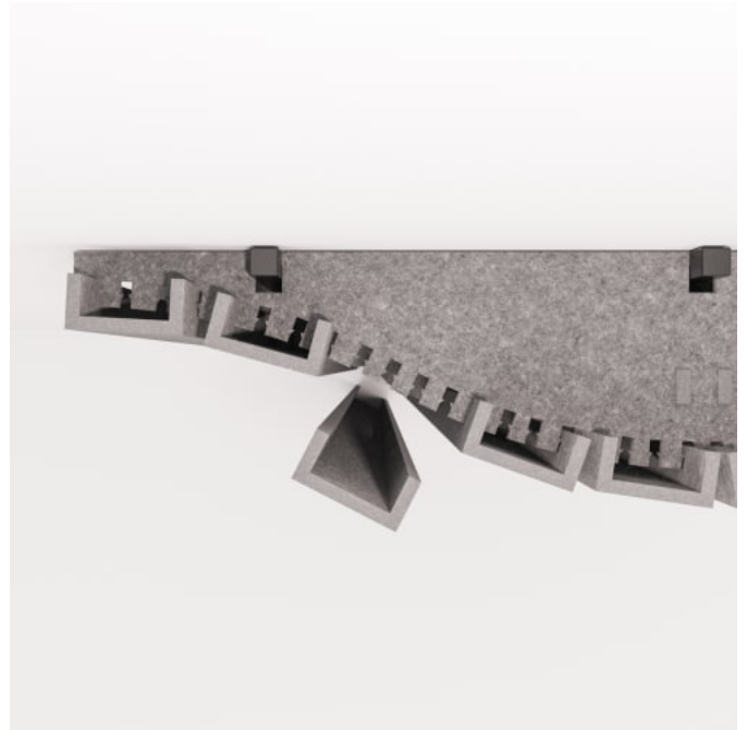
Curved Sticks Wide Comb Detail