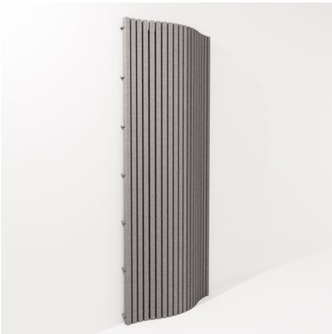
Curved Sticks Narrow Detail