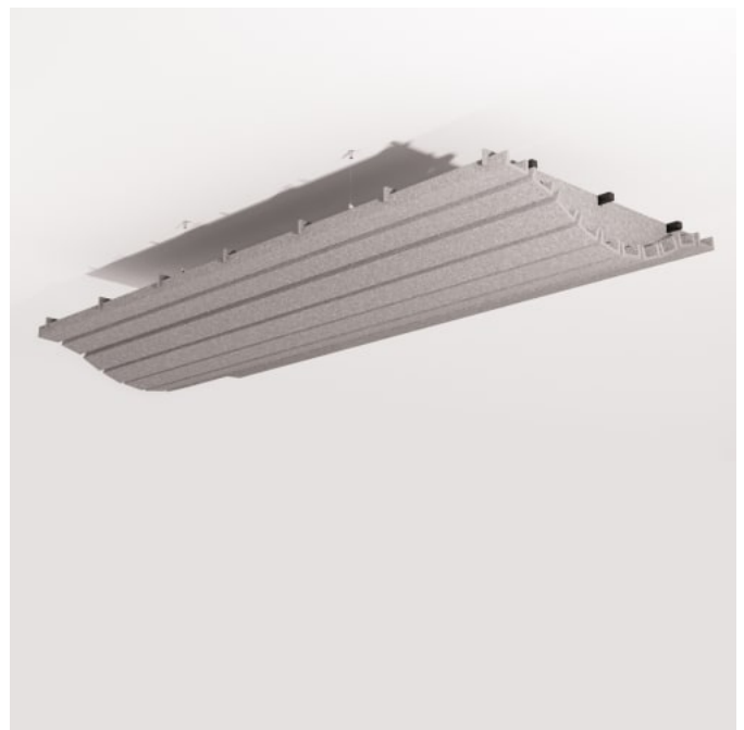
Curved Sticks Wide Hanging Detail