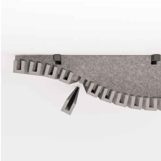
Curved Sticks Narrow Comb Detail