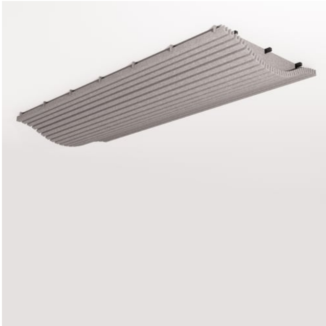
Curved Sticks Narrow Ceiling Detail