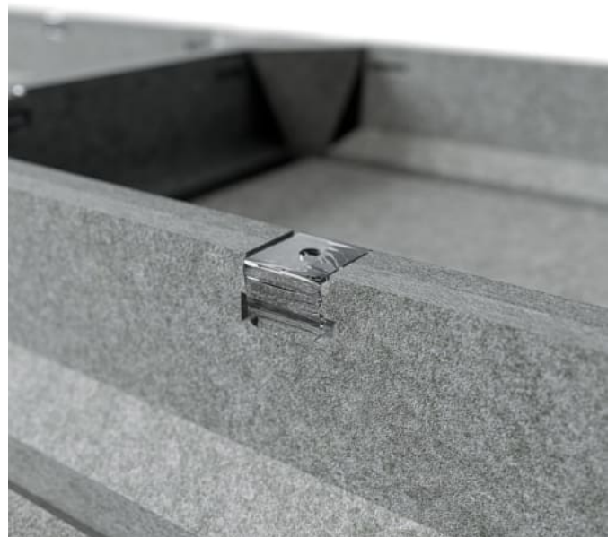
Box Tile Double Beams Clip Detail