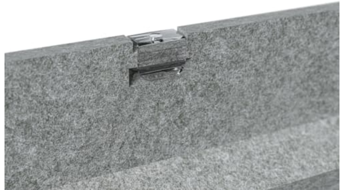
Box Tile Single Beams Clip Attached Detail