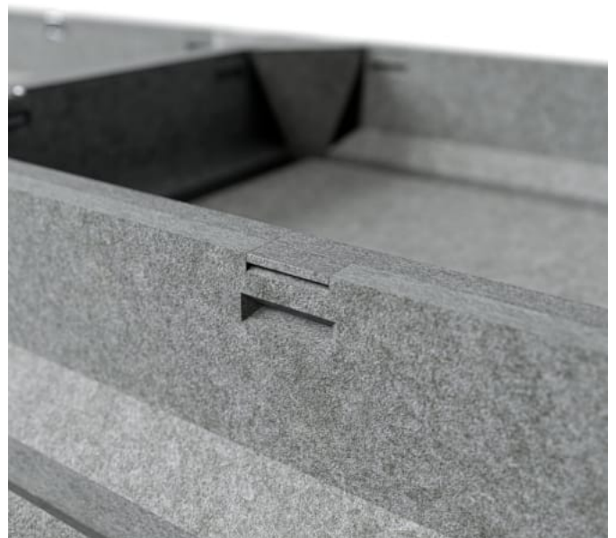
Box Tile Double Beams Clip Fixing