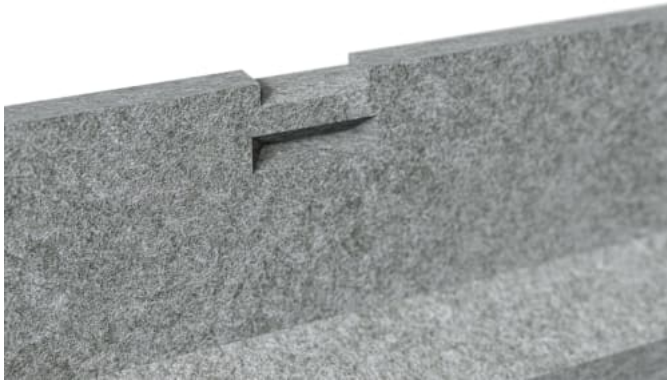
Box Tile Single Beams Clip Fitting Detail