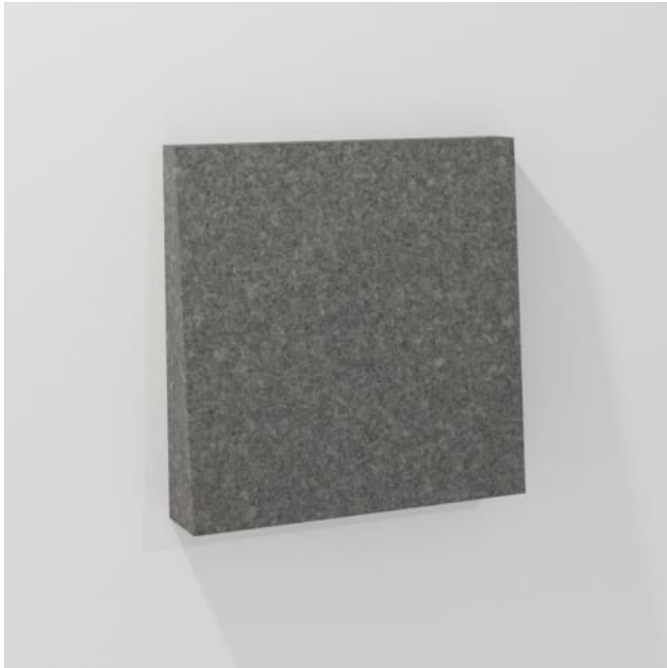
Box Tile Pitched