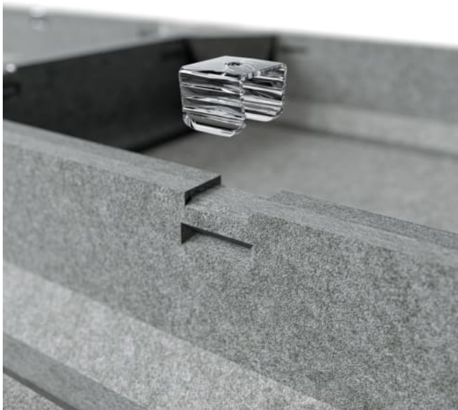
Box Tile Double Beams Clip Fixing Detail