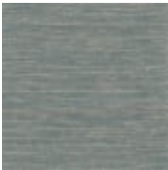
G0143NA0078 CASTOR GRAY