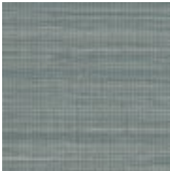
G0143NA0102 TEAL LEGACY