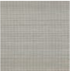
G0143NA0081 QUIET GRAY