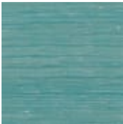
G0143NA0075 DEEP SEA