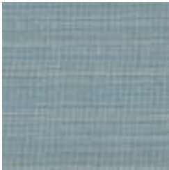
G0143NA0101 GREY & BLUE