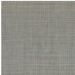
G0143NA0160 VINTAGE KHAKI