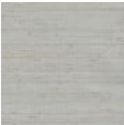
G0143NA2059 SILVER GRAY