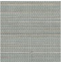
G0143NA0022 BELGIAN BLOCK