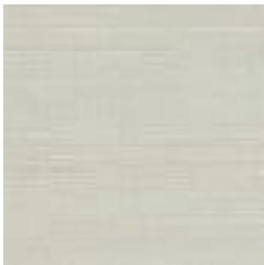
G0143NA2070 MILKY GREEN