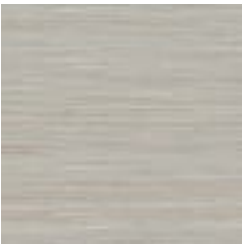
G0143NA2055 OYSTER MUSHROOM