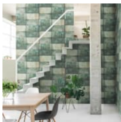
glass-beads-loft- lof412-lof713- promo-1.jpg

Wallcoverings » Decorative Wallcoverings