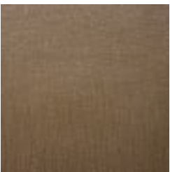
ASL-148533 TREASURE CHEST