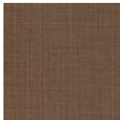
AZ53286 BASE BROWN