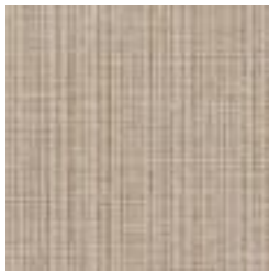
AZ53280 DOVE DEGREE