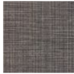
AZ53278 BISECT BLACK