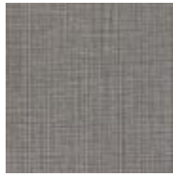
AZ53277 PEWTER POINT