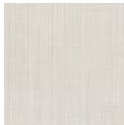
AZ53287 ACUTE NEUTRAL