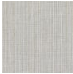
AZ53276 GRAPH GREY