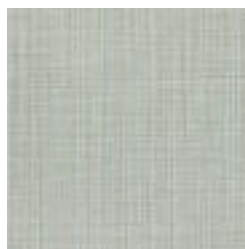
AZ53291 ADJACENT AQUA