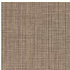
AZ53285 SABLE SEGMENT