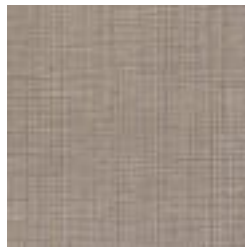
AZ53281 TAUPE TANGENT