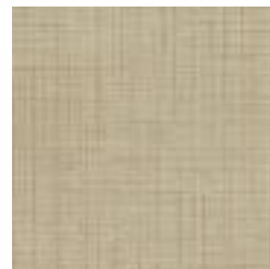
AZ53288 LICHEN LINE