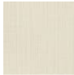
AZ53283 CONVEX CREAM