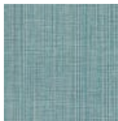
AZ53292 INKY INVERSE