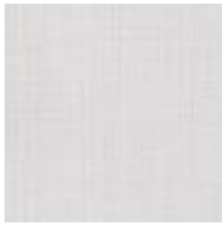
AZ53275 WHITE VERTEX