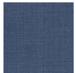
AZ53294 INFINITE BLUE