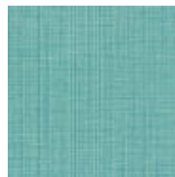
AZ53293 TURQ THEOREM