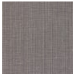
AZ53282 STONE SECANT