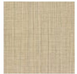
AZ53284 TRIG TAN