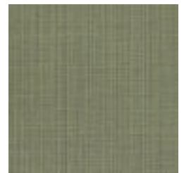
AZ53289 GEO GREEN