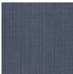
AZ53290 PLANE NAVY