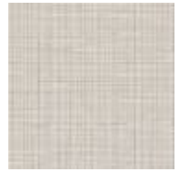
AZ53279 MEDIAN MALT