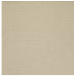
A65-127 DANBURY BEIGE