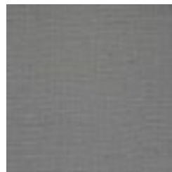
A65-527 SUFFOLK GREY