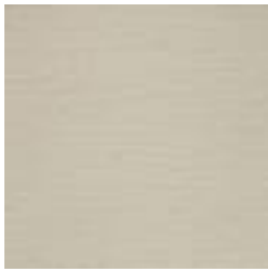
A65-035 WHITE PLAINS