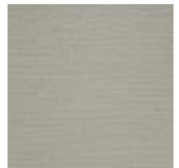
A65-567 OYSTER BAY