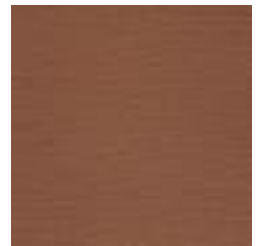
A65-433 COPPER WAY