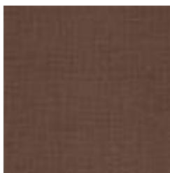
A65-661 BRIDGEPORT BROWN