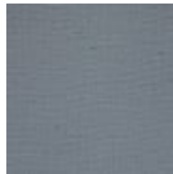
A65-343 WEST POINTE