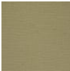
A65-282 PARK VIEW