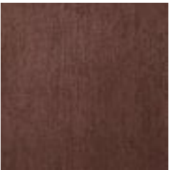
ASL-141699 DARK COPPER