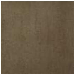
ASL-141789 BRASS LANTERN