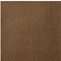
ASL-141712 ROSE GOLD