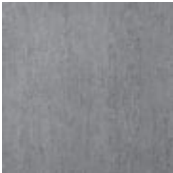
ASL-141594 SILVER STREAK