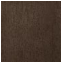
ASL-141513 IRON ORE