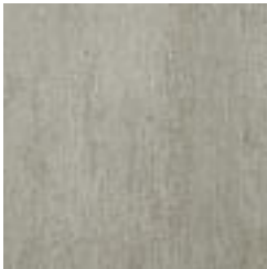
ASL-141852 ASPEN NICKEL