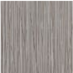
W2-SB-05 CINDER SHADOW