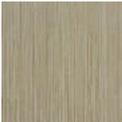
W2-SB-09 GOLDEN SAGE