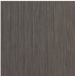
W2-SB-06 SATIN SLATE