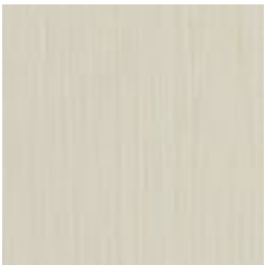
W2-SB-10 LINEN LUSTER