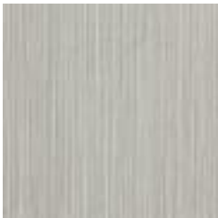
W2-SB-04 SILVERY FROST