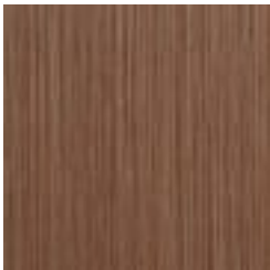
W2-SB-12 COCOA BUTTER