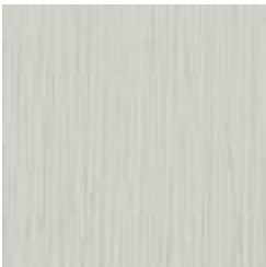
W2-SB-01 CLOUDY SHIMMER