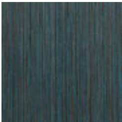
W2-SB-02 BLUE CARBON