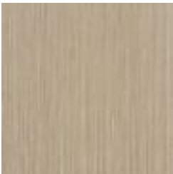
W2-SB-11 GLIMMERING SAND