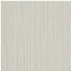
W2-SB-07 WARM & CLOUDY