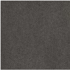
AZ52781 DARK SHADOW