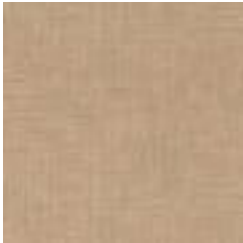
A183-466 BUTTER RUM