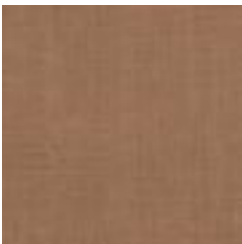
A183-667 EARTH TONE