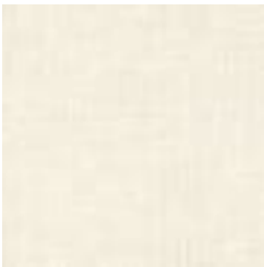
A183-007 BAY EAST