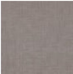
A183-524 COPPER- NICKEL