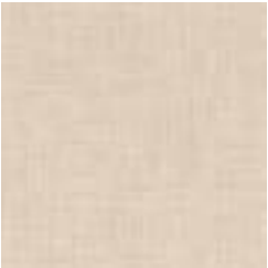
A183-190 SAND DOLLAR