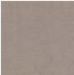
A183-563 LONDON FOG