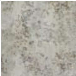
AZ53178 PLATINUM RECORD