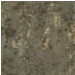
AZ53171 OZZY OLIVE