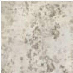
AZ53167 GROUPIE GREIGE