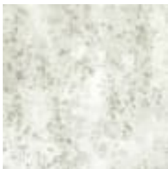
AZ53163 ROLLING STONE