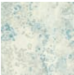
AZ53161 TAINTED TEAL