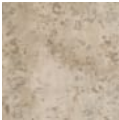
AZ53173 TWISTED TAUPE