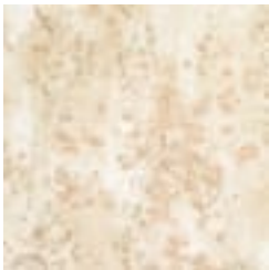
AZ53172 TOUR BUS TAN