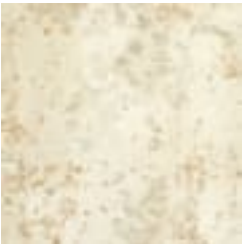
AZ53175 CREAM CONCERT