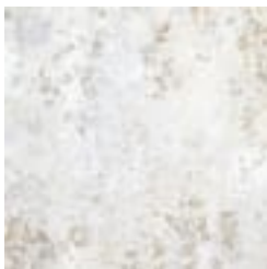
AZ53160 GUITAR SOLO