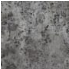
AZ53168 LIQUID STEEL