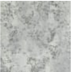
AZ53164 STEEL STRINGS