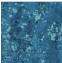
AZ53162 SAPPHIRE SLAYER