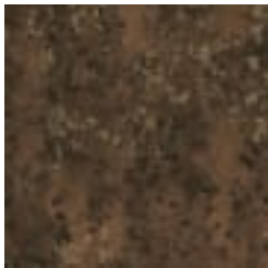
AZ53174 BACKSTAGE BROWN