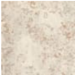
AZ53169 BEIGE BAND