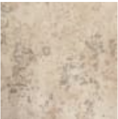
AZ53170 LIGHT LED