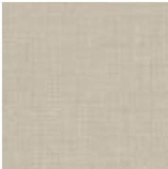
W2-DD-08 WORN PATH