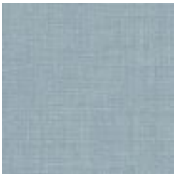
W2-DD-14 BAJA BLUEJEAN