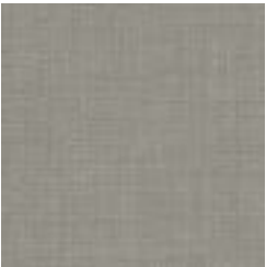
W2-DD-05 EAGLE TAIL