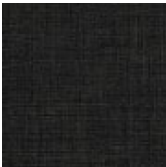
W2-DD-03 BLACK ROCK