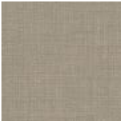
W2-DD-09 VINTAGE TAUPE