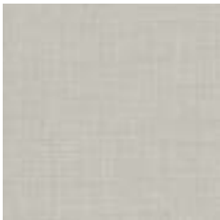
W2-DD-04 DESERT GREY