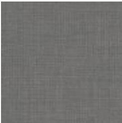
W2-DD-06 DARK SHADE