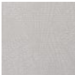
A164-816 HARBOR SEAL