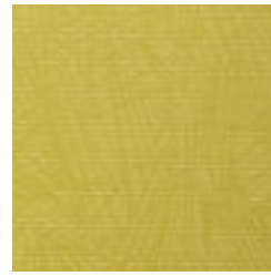
A164-232 PEA POD