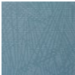
A164-364 SUMMER HOUSE