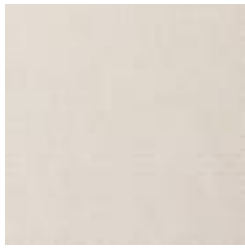
A164-110 SAND CASTLE