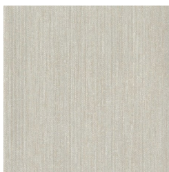
BX4453 LUCKY COIN