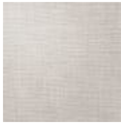
A197-106 NORTH BAY