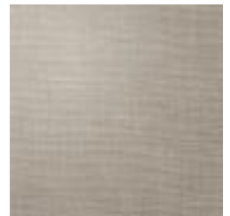
A197-524 PAPER BIRCH