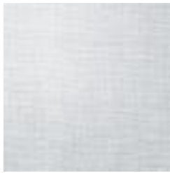
A197-081 SILVER LEAF