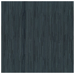
24 DEEP TEAL