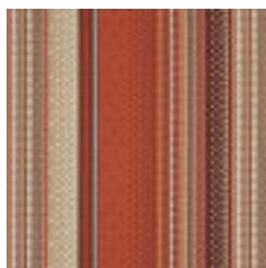
1008790 TERRA COTTA