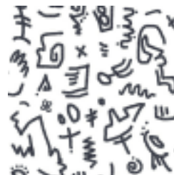
990 BLACK WHITE