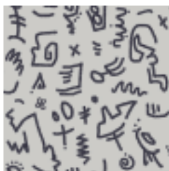
583 GREY STONE