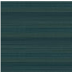
24 DEEP TEAL