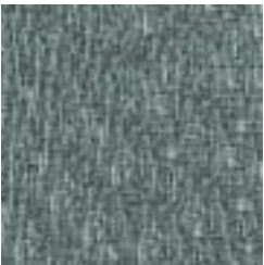
31 BLUE MIST