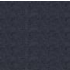
3009 MIDNIGHT BLUE