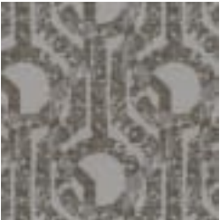
89 SMOKEY QUARTZ