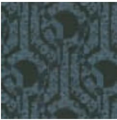
37 BLUE MOON