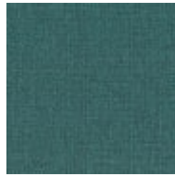
CRL 34 JASPER