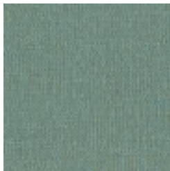
CRL 30 SURF