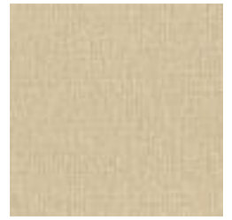
CRL 33 MACADAMIA