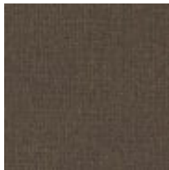
CRL 36 TRUFFLE