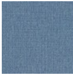
CRL 31 DELPHINIUM