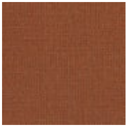
CRL 35 AMBERGLOW