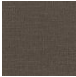
CRL 37 CHARCOAL