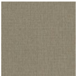
CRL 32 MOREL