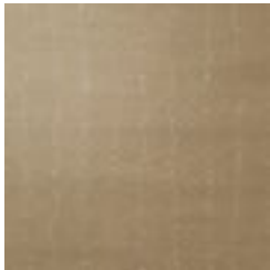
AVF02-508 TABLE MOUNTAIN