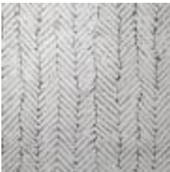
AVF02-053 NORTH END