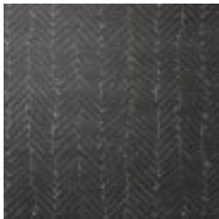
AVF02-579 HILLBROW TOWER