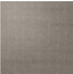
AVF02-547 ROBBEN ISLAND