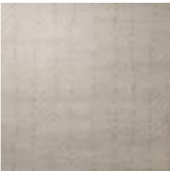
AVF02-125 CLIFTON BEACH