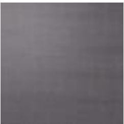
AVF02-590 ACORN STREET