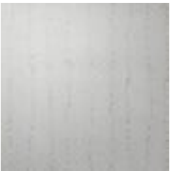
AVF02-024 GOOD HOPE