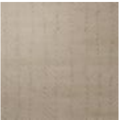
AVF02-531 CITY BOWL