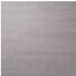
AVF02-562 PONTE CITY