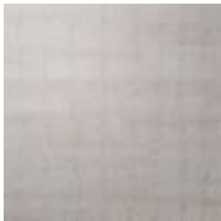
AVF02-186 SIGNAL HILL