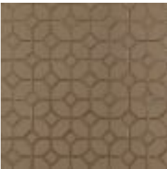
T117TF3512 GRAY MATTRESS