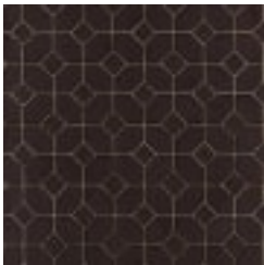
T117TF3514 DEEP DIANE