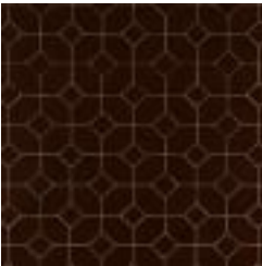
T117TF3517 MUHA COFFEE