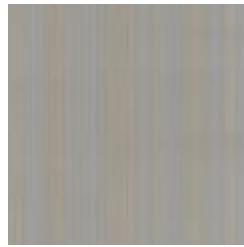
AZ53387 DOLPHIN GREY