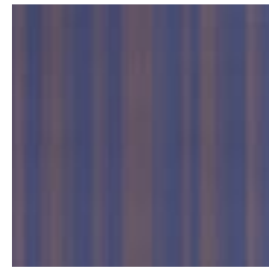
AZ53388 COBALT CABANA