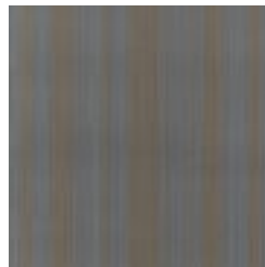
AZ53392 DEEP OCEAN