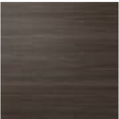
AVF01-528 HARZ MOUNTAINS