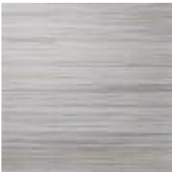
AVF01-025 ICE BLINK