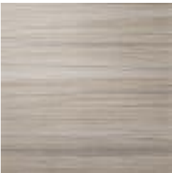
AVF01-108 DAY DREAM