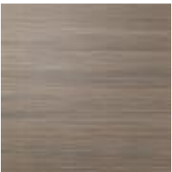
AVF01-587 FOOL'S PARADISE