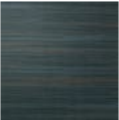
AVF01-216 WATER SKY