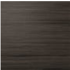
AVF01-534 BROCKEN SPECTRE