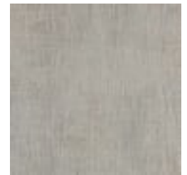
BB-HH-09 CAFFE CREAM