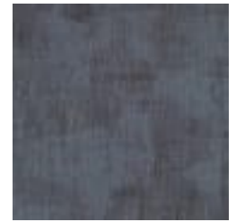
BB-HH-04 SUBWAY SLATE