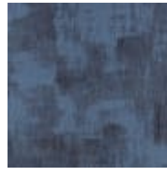
BB-HH-03 COBALT CLUB