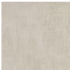
BB-HH-10 BOHO BEIGE