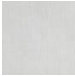
BB-HH-01 ROOFTOP FROST