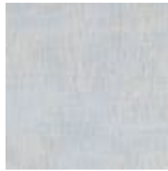
BB-HH-02 SKYSCRAPER BLUE