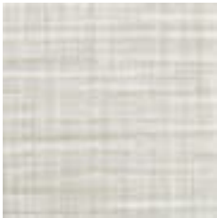
AZ52832 NEUTRAL NOT