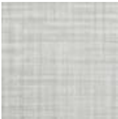
AZ52837 SOFT SONG