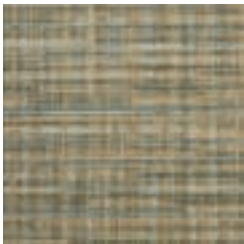
AZ52826 COUNTRY CORD