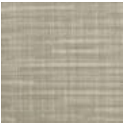
AZ52835 ROCK BAND