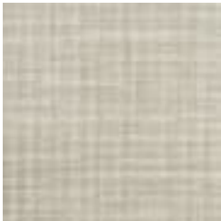
AZ52831 ECRU ENSEMBLE