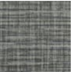
AZ52839 DARK DUET