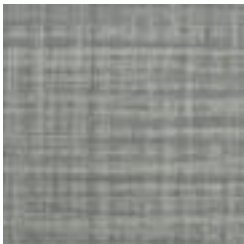
AZ52836 SILVER SONATA