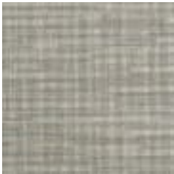
AZ52833 TAUPE TEMPO