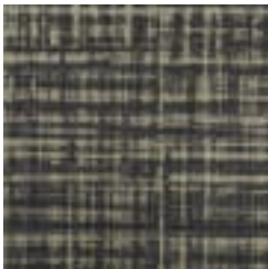
AZ52827 BLACK METAL