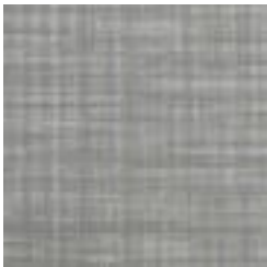
AZ52838 HAZY HARMONY