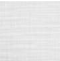
AZ52834 AIR DRUMS