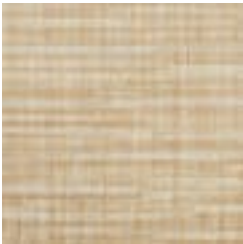
AZ52830 GOLDEN GUITAR