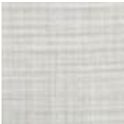
AZ52828 MISTY MELODY