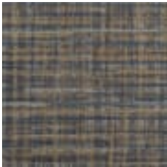
AZ52842 NIGHT VOICE