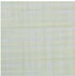
AZ52825 LIME KEY