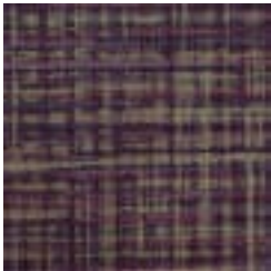
AZ52841 PURPLE PIANO