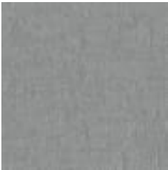
AZ53656 CUE GRAPHITE