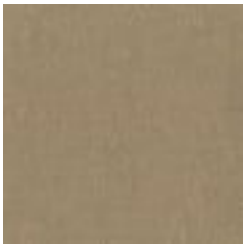
AZ53652 ANTIQUE BRASS