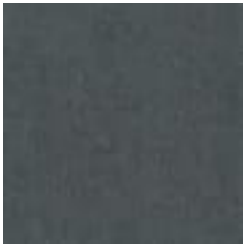
AZ53657 DEEP TEAL TEMPO