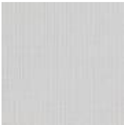
BB-NA-27 LIGHT YEAR