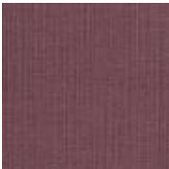
BB-NA-26 SWEET PLUM