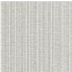
BB-NA-01 WHITE SAND