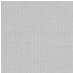
BB-NA-20 CLEAR SKYS