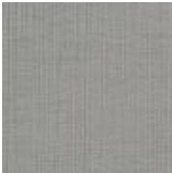
BB-NA-22 GREY SHADOW