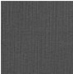
BB-NA-23 BLACK HOLE