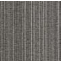
BB-NA-12 NIGHT SKY