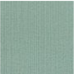
BB-NA-29 JEWEL TONE