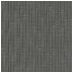
LUZ1-09 MANILA BAY