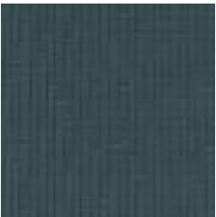
LUZ1-10 PHILIPPINE SEA