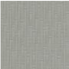
LUZ1-06 TAAL LAKE