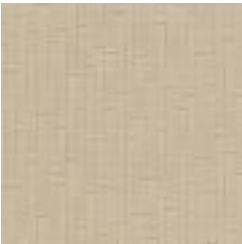
LUZ1-07 RICE TERRACE