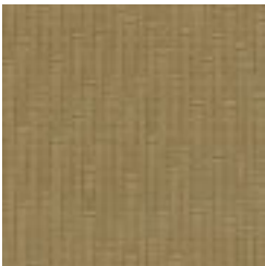
LUZ1-11 GOLD MINE