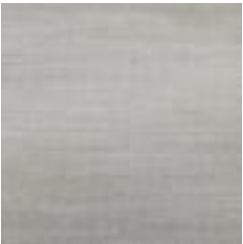
W2-HZ-05 MISTY GREIGE