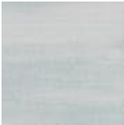
W2-HZ-07 CLEAR SKIES