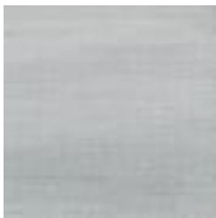
W2-HZ-01 WHITE CAP