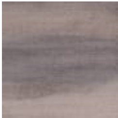
W2-HZ-06 DUSKY SUNSET