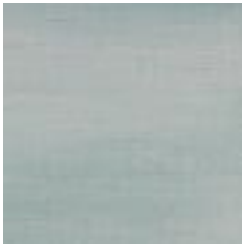
W2-HZ-08 INFINITE BLUE