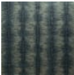
AZ52820 KARAOKE NIGHTS