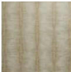
AZ52821 GOLDEN RADIO