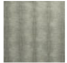
AZ52819 PUNK ROCK