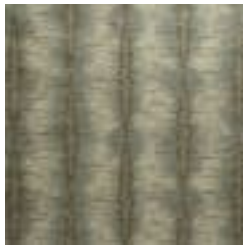
AZ52816 COUNTRY CONCERT