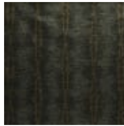
AZ52817 HEAVY METAL