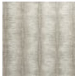
AZ52822 NEUTRAL NOISE