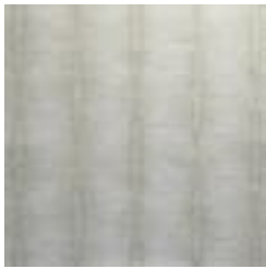
AZ52815 MORNING MELODY