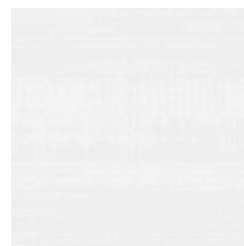
P3T-60314 WHITE QUARTZ