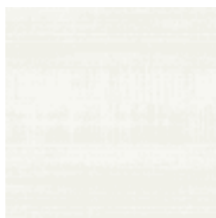
P3T-60312 ROYAL ALABASTER