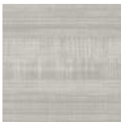
P3T-60316 RAMADY PUMICE