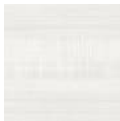
P3T-60313 PEBBLE ALLEYWAY