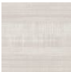
P3T-60311 TAROUDANT SLAB