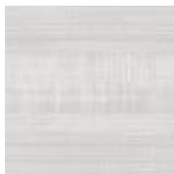
P3T-60315 SALE GRAVEL