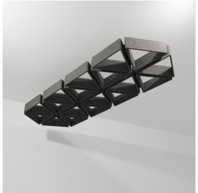
Baffles Connect Prismatic Detail